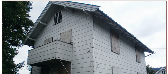
Eternit boards on house facades.