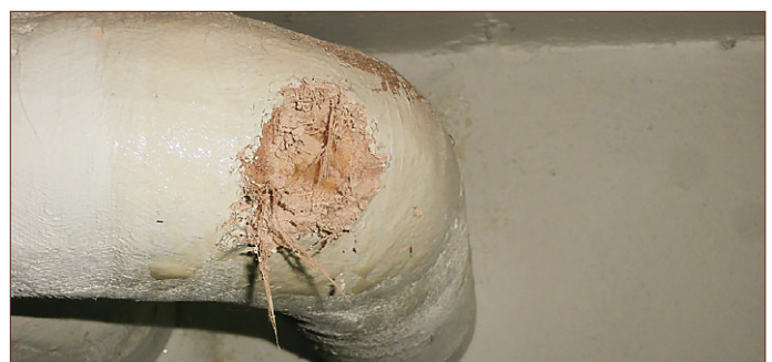
Asbestos material in pipe insulation on pipe bends. Most common in the period from 1955 to 1978.