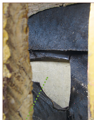
Wind stopper board (thin, hard, yellow board) in the outer wall behind black cardboard. Can often be found in wooden cladding and in metal board cladding.