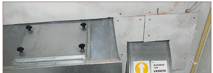
Asbestolux boards in the ceiling in a ventilation room. Asbestos boards often have a white-gray color. Asbestos boards do not have a paper surface. (Gypsum boards has a paper surface and does not normally contain asbestos).