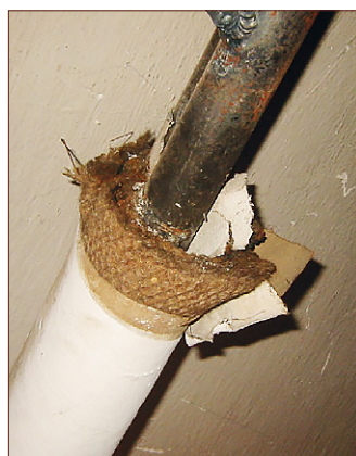
White asbestos cardboard covering the pipe. Most common in the period from 1900 to 1960.